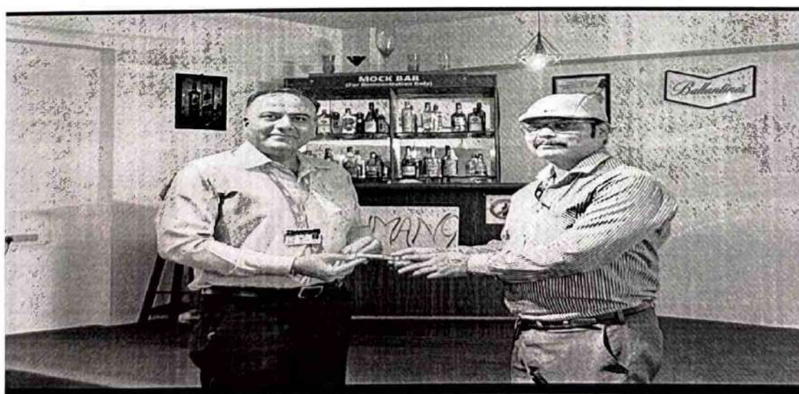
Event's highlight of SoHM Umang Club activity, Babu Banarasi Das University on 25 th October 2024